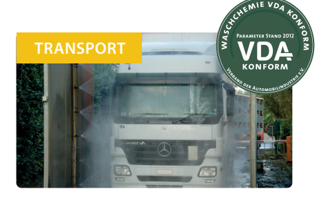
Virocid<sup>®</sup> is approved by the VDA, the German Automobile Association as "Class A" (non corrosive). Dilution: 0.25-0.5%.